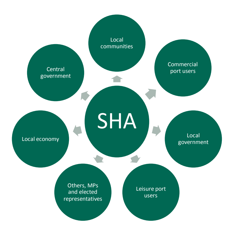
Figure 3 SHA and stakeholders