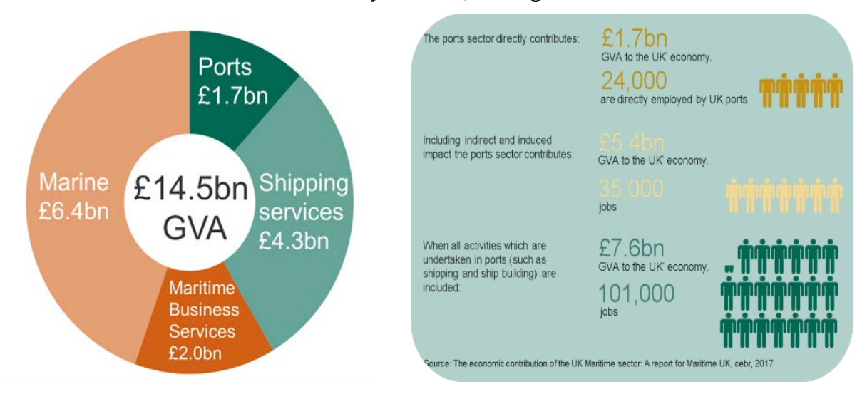
Figure 1 Maritime and ports sector contribution to GVA (2016)

1.11 The ports sector is an essential part of the UK economy, ensuring that goods and people can move smoothly and efficient in and out of the country, so facilitating trade, and tourism and economic growth. The ports sector is estimated to directly employ 24,000 people and generate value added of some £1.7bn. Including indirect, induced and wider activities undertaken in ports increases this to 101,000 jobs and £7.6bn value added. The maritime sector in total generated £14.5bn direct value added contribution to the UK economy in 2016, see figure 1 below.